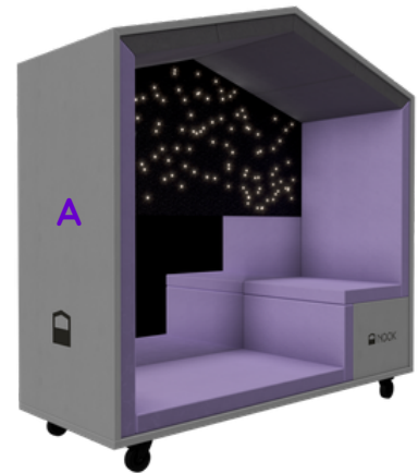
Logo Placement Options

Monitors safely mount to rear wall. Please contact Customer Service for additional information.